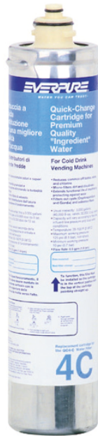
4C Replacement Cartridge: EV9600-00 (1-pack) EV9601-00 (6-pack)

Delivers premium quality water for cold cup vending applications